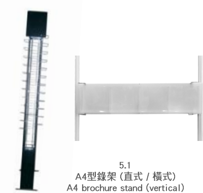
A4 brochure stand (vertical) A4 brochure rack (acrylic)